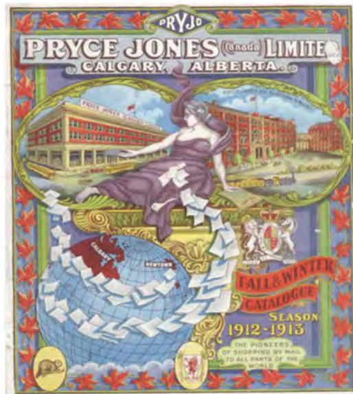
Fall and Winter Catalogue Cover Pryce Pryce-Jones Department Store Calgary: 1912 - 1913