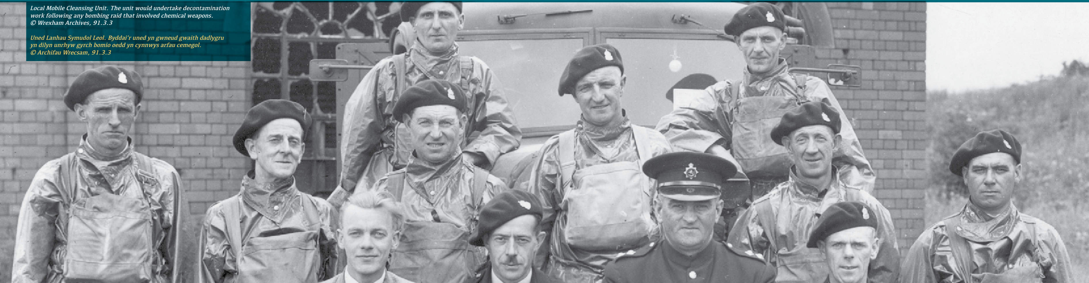
Uned Lanbau Symudol Leol. Byddai'r uned yn gwneud gwaith dadlygru yn dilyn unrhyw gyrch bomio oedd yn cynnwys arfau cemegol. © Archifau Wrecsam, 91.3.3