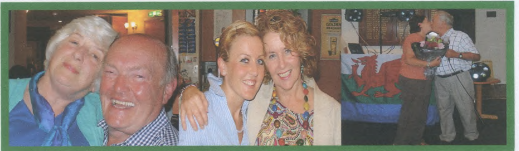
Cowbridge MVC - Hog Roast 25th June 2011 At Cowbridge RFU Club