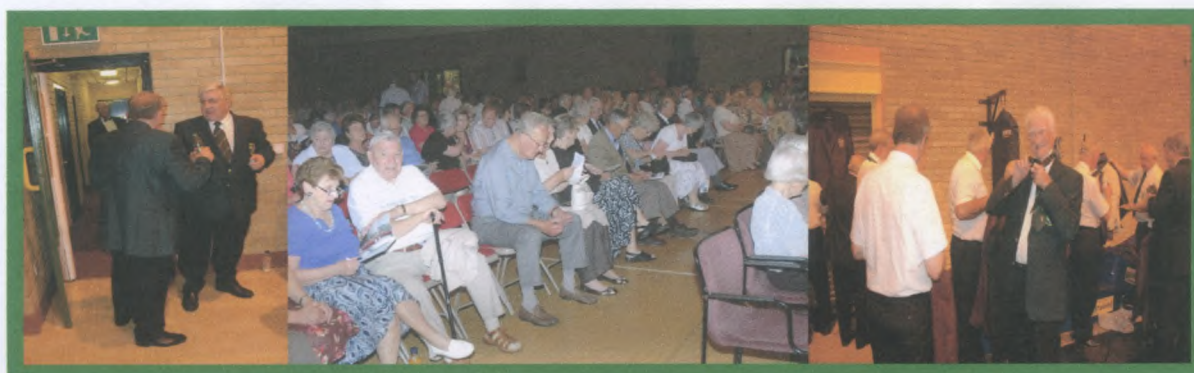
Front of hall and back stage photographs Annual Concert 2010 at Cowbridge