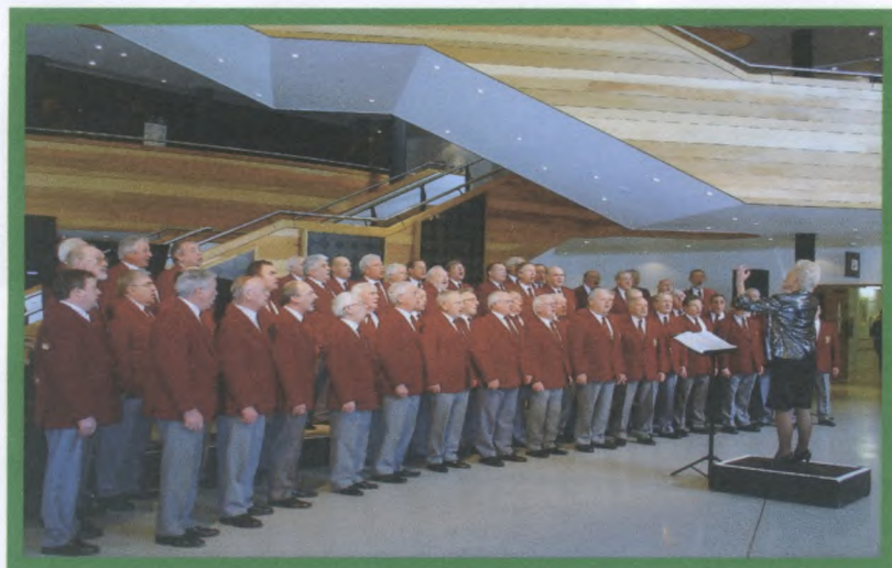
Millennium Centre Concert Cardiff 2007 Note the old style Maroon Blazer and Grey trouser choir uniform. This was changed in 2010 to a Green Blazer and Black trouser combination and given its first public showing during the second half of the May 2010 An- nual Concert in the Cowbridge Lei- sure Centre.

Because of commitments the Choir had to celebrate its fortieth anniversary in March 2011, although the actual date should have been during the late summer of 2010. However; a few months did not take away from the excellent achievement of the founder members of the choir. After a gigantic effort, which included the delivery, on foot of over a thousand posters advertising for chorister, or any male interested in singing to join the fledgling choir, a mighty Oak grew from small a acorn.