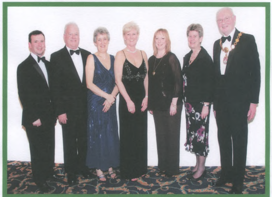
40th Anniversary Celebration Dinner at The Bear Hotel Cowbridge on Saturday 26th March 2011