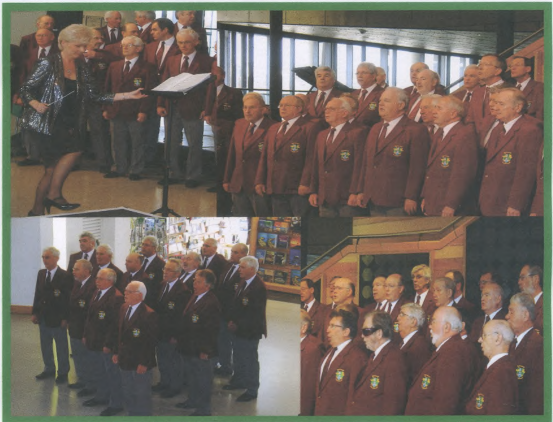
Selection of photographs taken at the May 2010 Millennium Centre free public concert