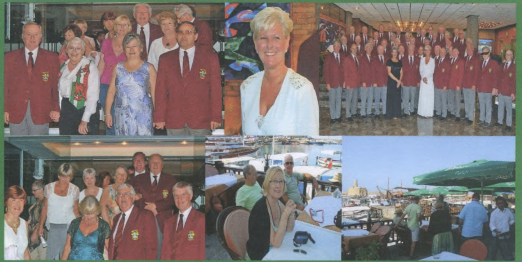
Cyprus Tour Choir 2007 - performed two concerts in aid of the 'Help the Heroes' charity