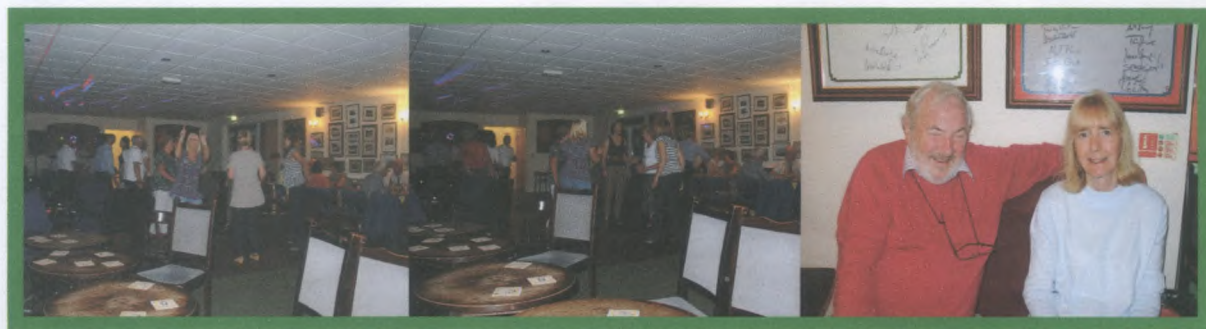
Presentations (Centre Pictures) to the lady's of the choir Who grace us with their presence and work hard to support our Charitable Organisation