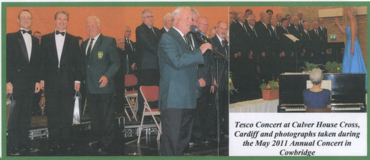
Tesco Concert at Culver House Cross, Cardiff and photographs taken during the May 2011 Annual Concert in Cowbridge