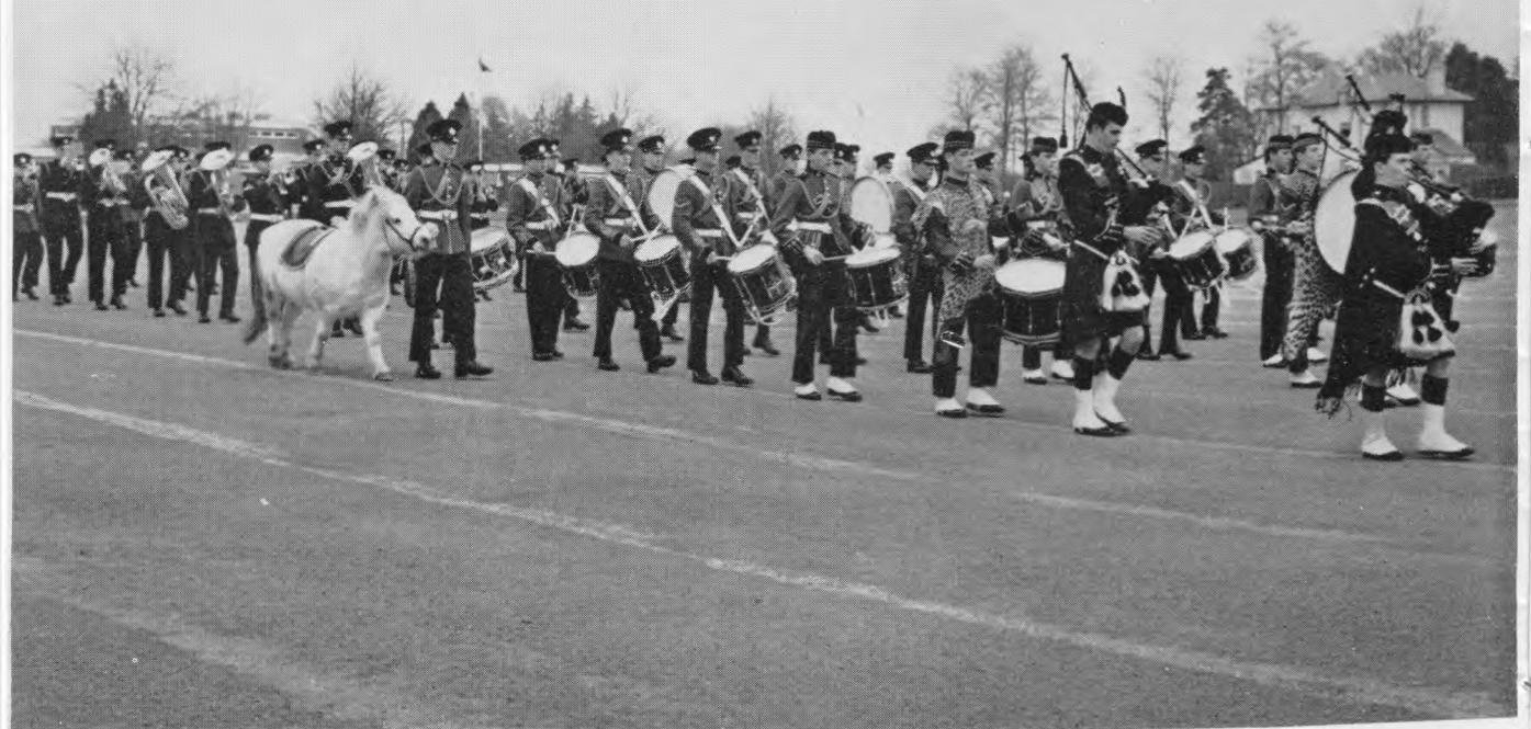
The Massed Bands of the Army Apprentices College, Chepstow.

The College was founded on 25th September 1923 and moved to Chepstow in 1924. It has trained Army apprentices since then without a break, producing tradesmen for the Royal Armoured Corps, Royal Artillery, Royal Engineers, Royal Corps of Signals, Royal Army Service Corps (now the Royal Corps of Transport), Royal Army Ordnance Corps, Royal Army Medical Corps and Royal Electrical and Mechanical Engineers.