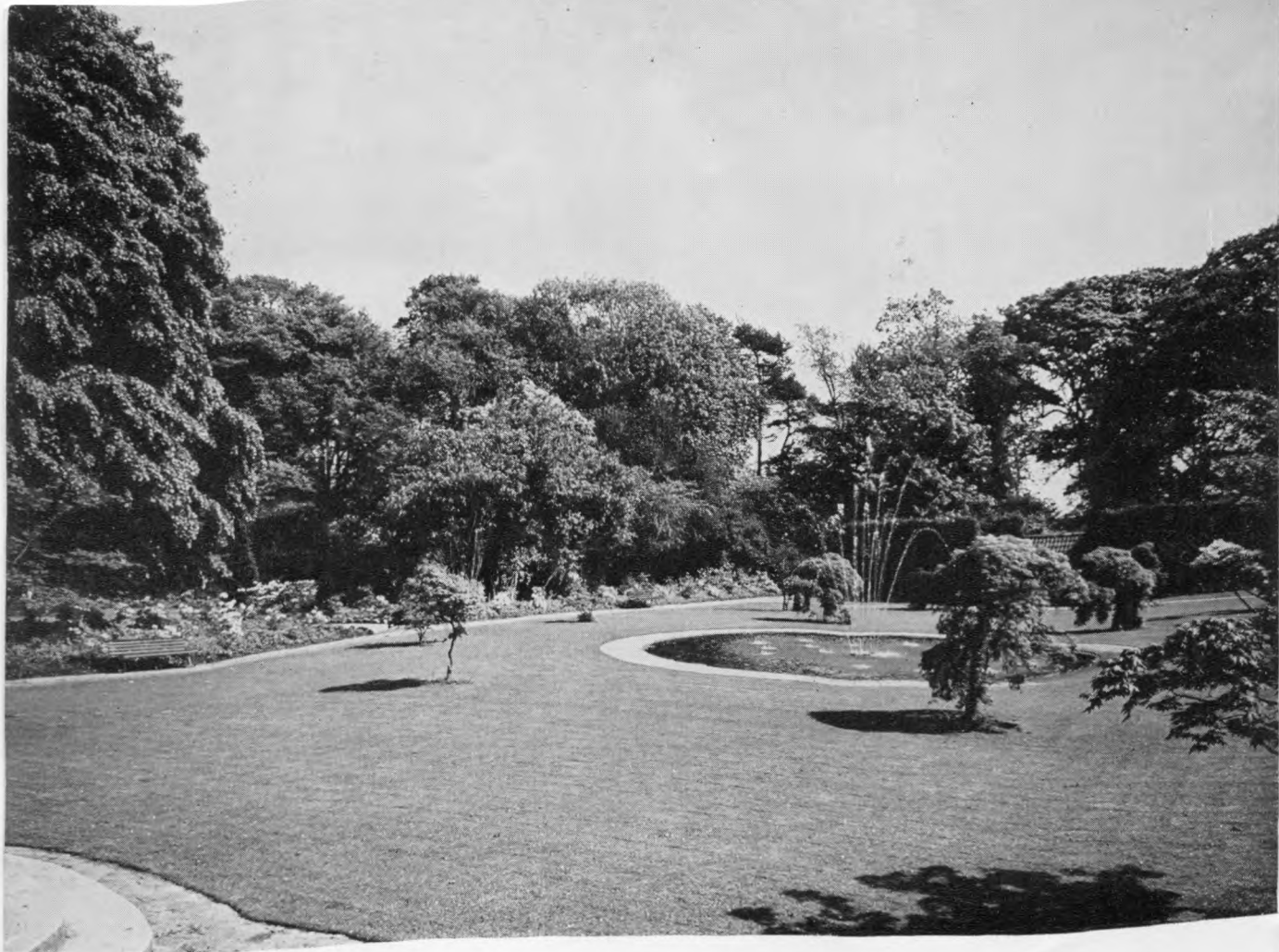
The West Garden