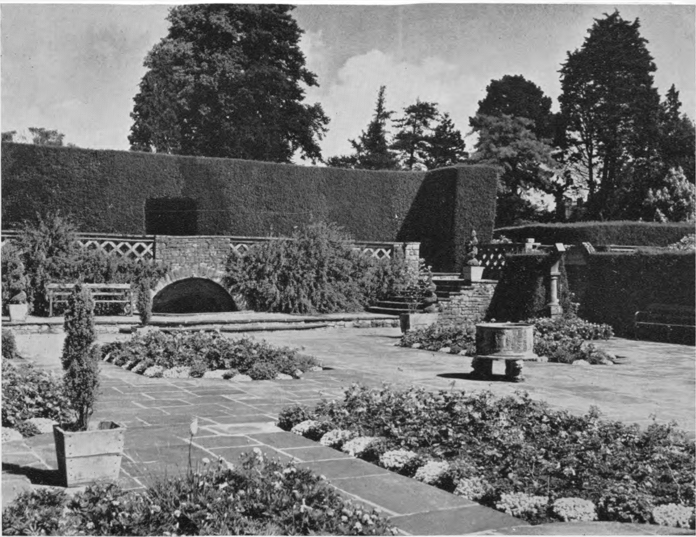
The Paved Court

Little could be done for the next seven or eight years because of the war. Since then, however, the Glamorgan Education Committee have made considerable progress in the use of the house and the development of the grounds. From 1948 onwards, increasing use has been made of the house as a residential centre for a wide variety of educational courses for teachers, instructors, youth leaders and sixth form pupils, etc. New hostel accommodation has now been provided and the Authority, in conjunction with the Welsh Joint Education Committee, are now able to provide accommodation for a maximum of 90 persons per week. The courses now provided can be attended by teachers and others from the constituent Authorities who have agreed to contribute towards the cost of maintaining the Centre. In addition, accommodation is now being provided for specialist courses run in conjunction with bodies such as the Department of Education and Science, the Open University, and University College Extra Mural Departments.