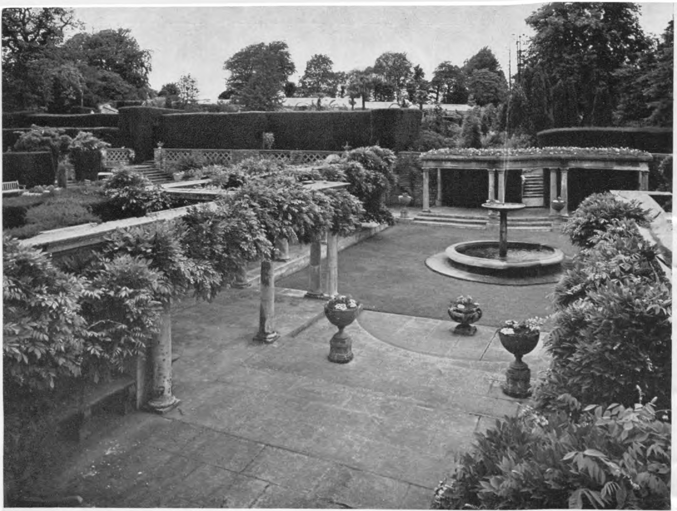
The Fountain Court

The Rose Garden, completed in 1967, contains the usual plantings of the modern Hybrid Tea and Floribunda Roses with an extensive collection of Rose species and representative plants of all the sections of the Rose family, not often to be seen in such extent.