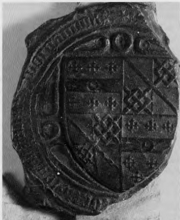
The Seal of Richard Beauchamp, Earl of Worcester, Lord of Glamorgan and Morgan, on the Cowbridge Charter of 1421

The Coat of Arms quarters Beauchamp (a fess charged with a crescent, between 6 cross crosslets), and Despenser (quarterly, in the second and third a fret, over all a bendlet)