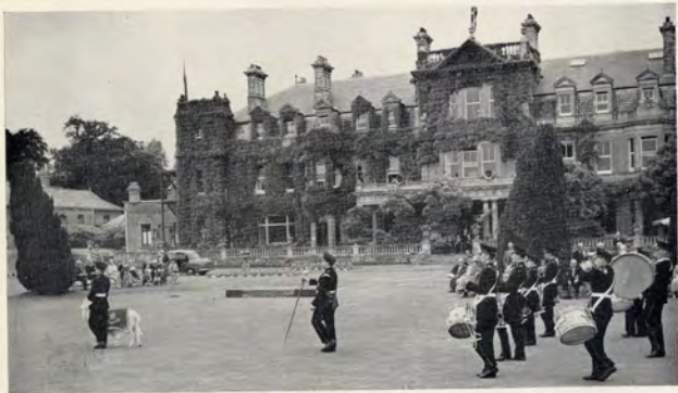
THE BAND AND CORPS OF DRUMS OF 6TH (GLAM.) BN. THE WELCH REGIMENT (T.A.)