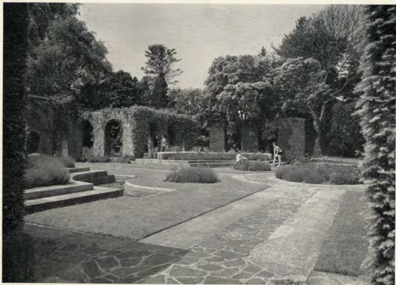
THE LAVENDER COURT