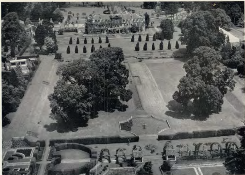
AERIAL VIEW OF DYFFRYN HOUSE AND GARDENS—SOUTHERN ASPECT