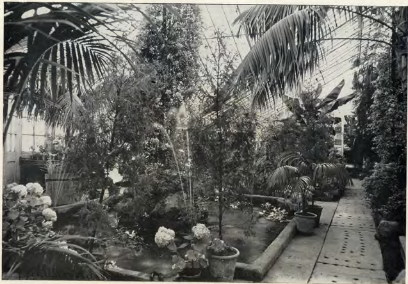
THE PALM HOUSE