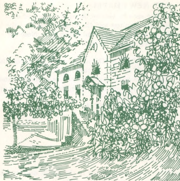
The Stable Block

The central three-storey part of the house is Georgian (1756), and is a fine example of Chaste, restrained eighteenth-century taste. The two wings were added in Victorian times and in 1910 by the Blandy