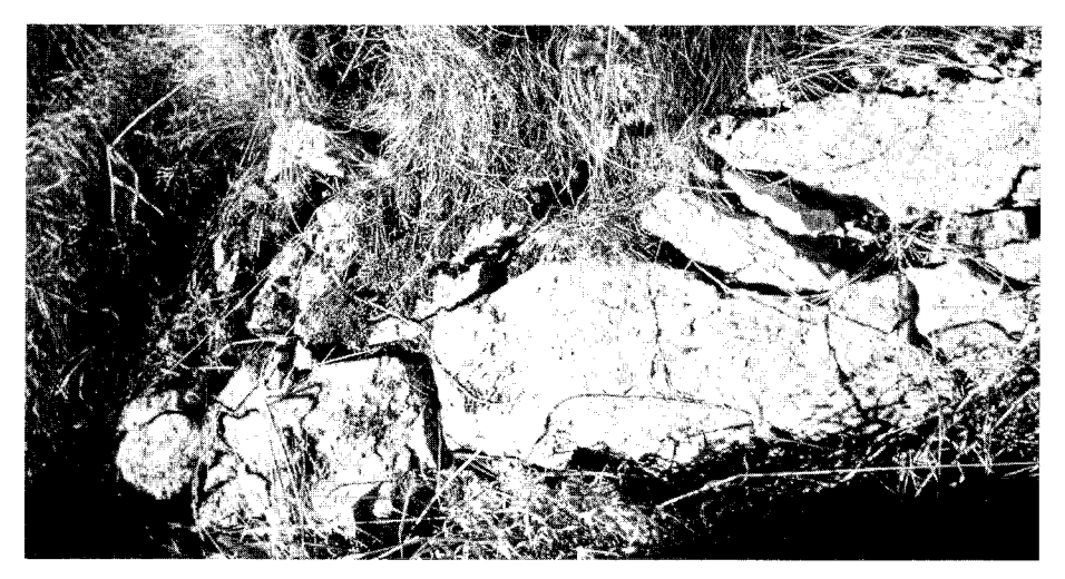
Remains of medieval effigy