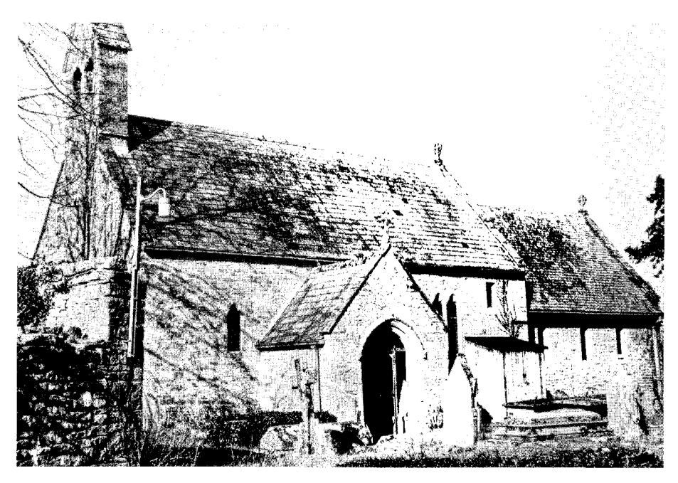
Church Exterior, 1984