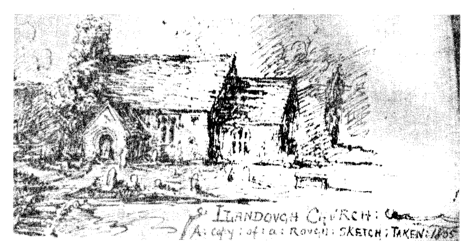
Church Exterior before restoration, 1865