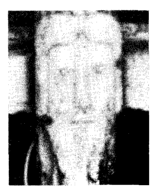
Head of Christ