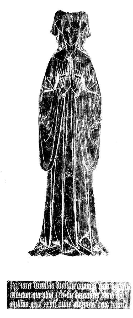
Monumental Brass. Wenllian Walshe, died 1427