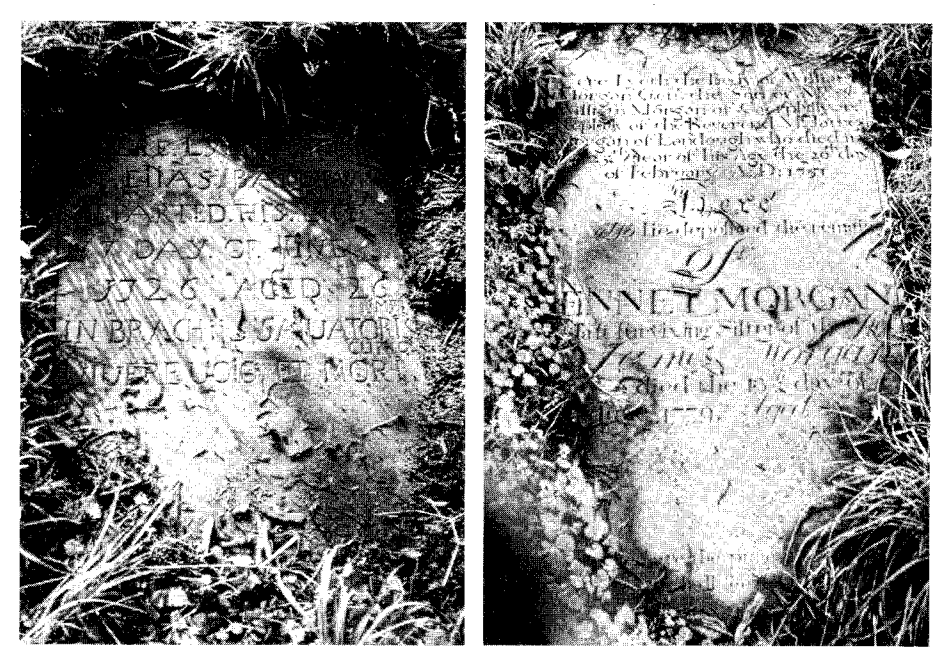
Two eighteenth-century tombstones