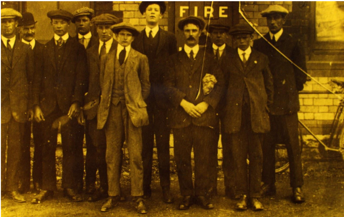
Volunteers at Cowbridge railway station

"And there with the rest are the lads that will never be old."