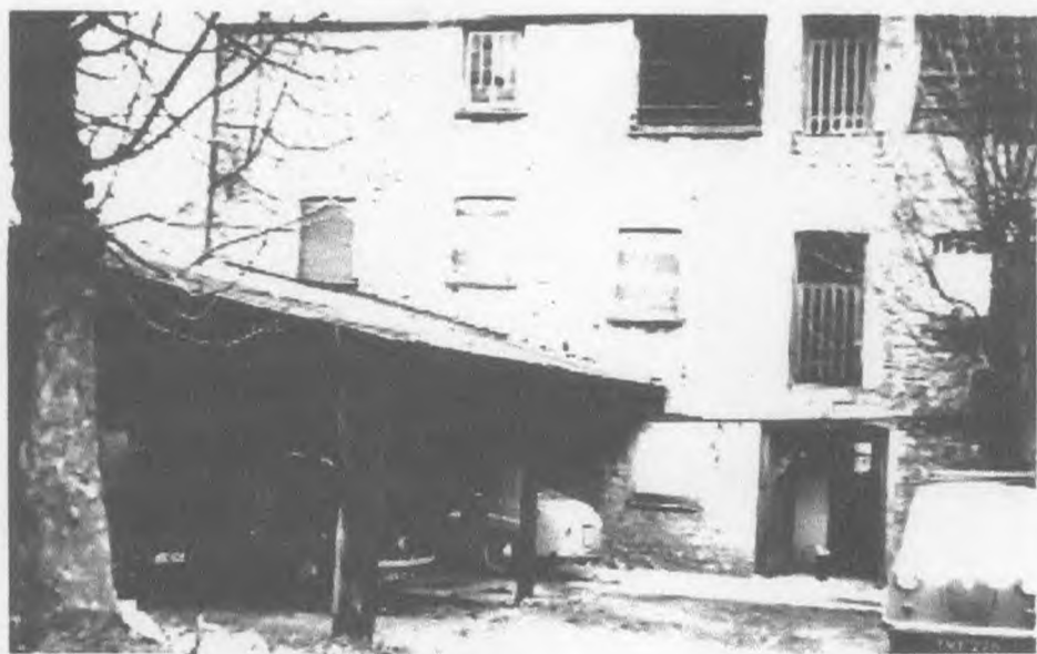
? PONTYCLUN BREWERY