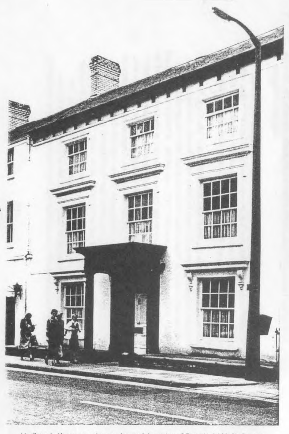
His surgery at Caecady House in the High Street must have been the envy of all window-box gardeners