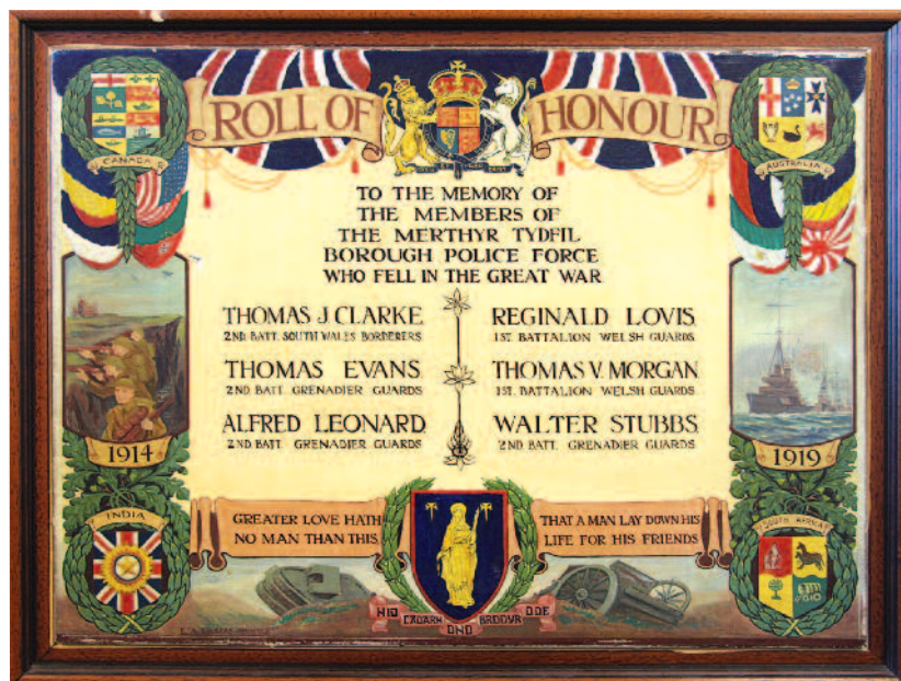
This memorial is in the new Merthyr Police Station