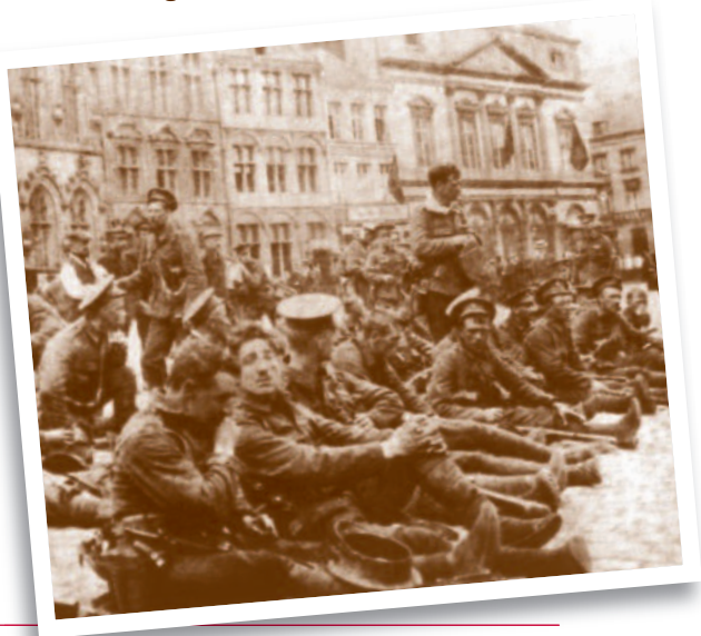
Mons, Belgium 1914

British and German soldiers on the Western Front agree a “Christmas Truce” when the fighting is halted and soldiers from the opposing armies meet and exchange things like badges, cigarettes etc.