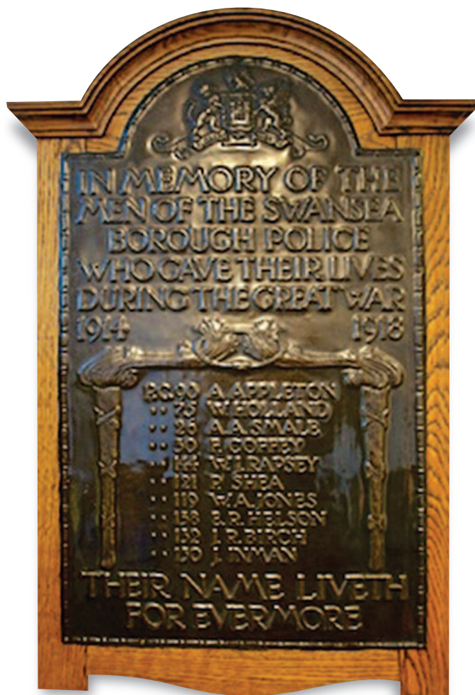
The above plaque, commemorating those from the Swansea Borough Police who died during the First World War, is now in the Central Police Station, Grove Place, Swansea having been moved there from the former central police station at Alexandra Road. It was rededicated by the Bishop of Swansea and Brecon at a service held on 26th March 2002.