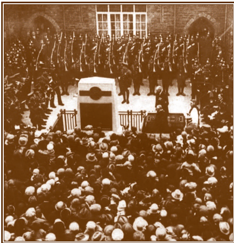
The Unveiling of the War Memorial at Canton Police Station in 1925

The Memorial which now stands in front of the Main Building at force headquarters at Bridgend commemorates those members of the Glamorgan Constabulary who died during the First and Second World Wars. It originally stood outside Canton Police Station in Cardiff when the