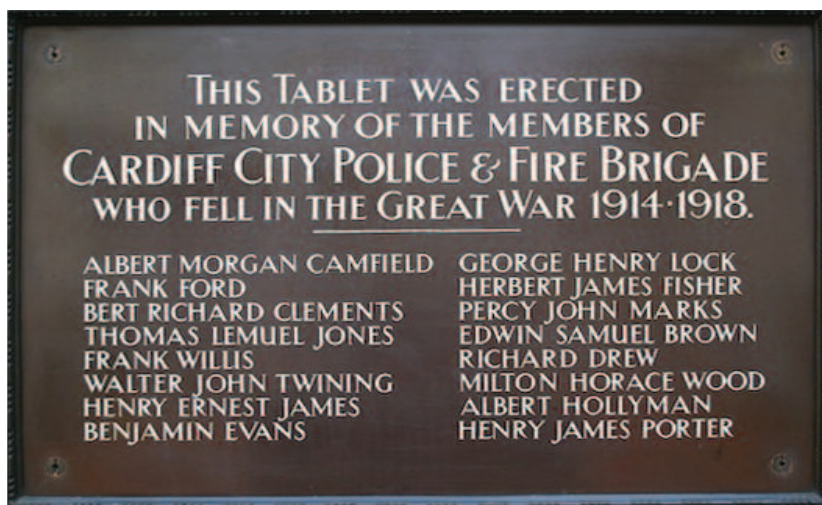
This Memorial Plaque is now in the Cardiff Bay Police Station