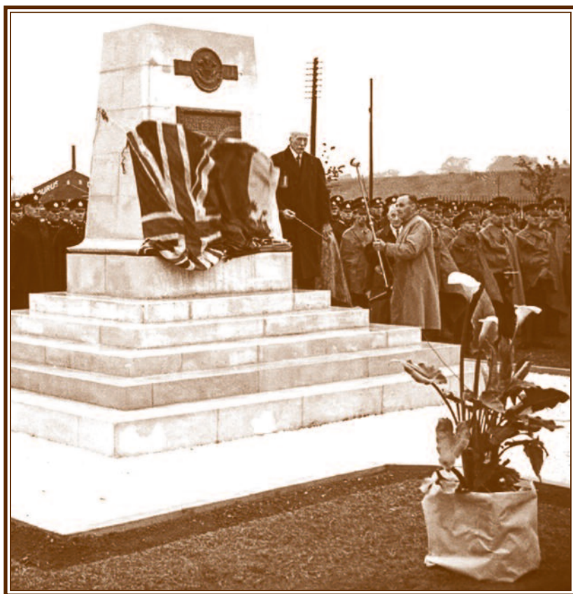
The Unveiling of the War Memorial at Police Headquarters, Bridgend in 1955

The present headquarters of South Wales Police originally formed the administrative buildings of the Royal Ordnance Factory which operated on the site during the Second World War. The Glamorgan Constabulary Headquarters moved there from Cardiff in 1947.