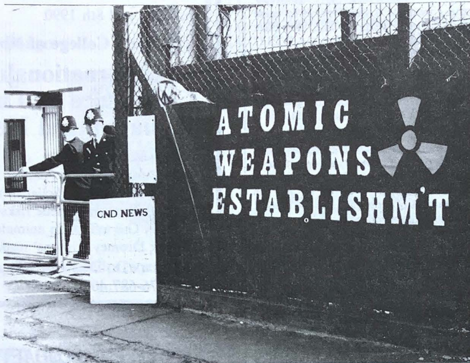
'Shut Trident Out' protest at AWE Cardiff on March 31