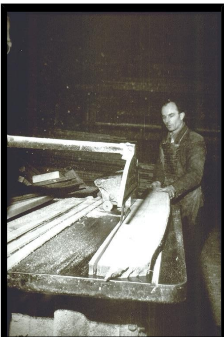
He takes them to the local sawmills to be cut into 7-foot lengths. Each about 1 inch wide and 1/8 inch deep.