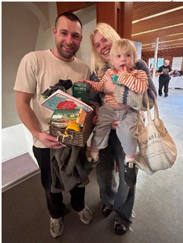
St. David's Day Celebration 2026 (Left & Middle); Black Diamond Celebrations 2026 (Right)