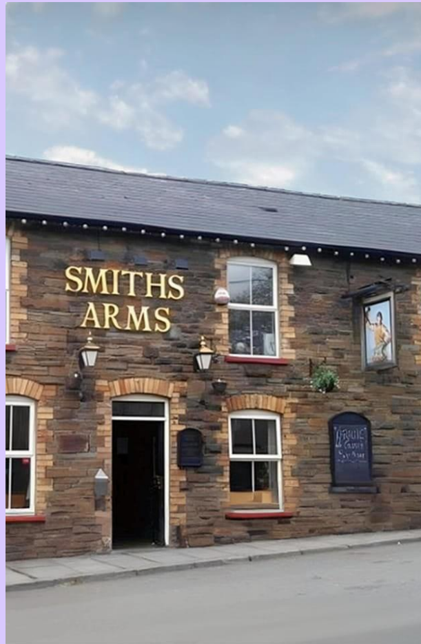
The Smith's Arms today