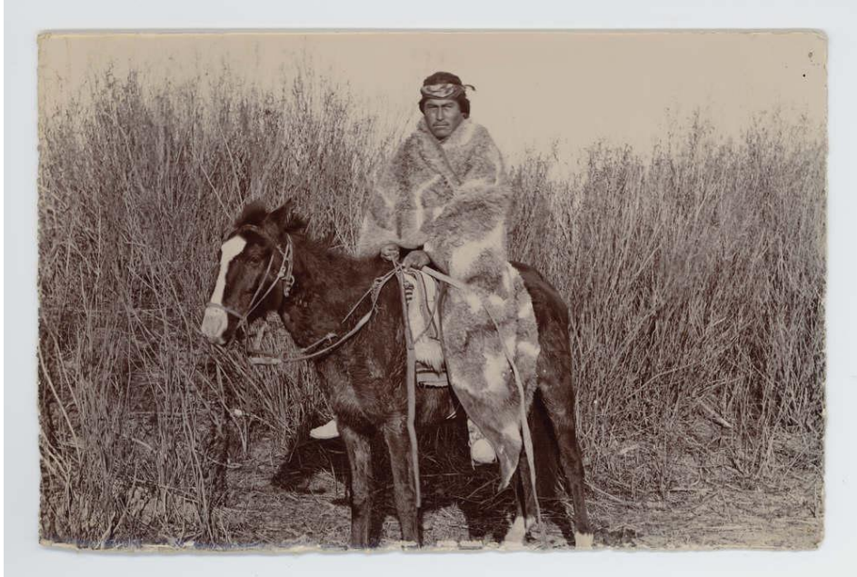
Native Patagonian wearing a cloak made from guanaco skins