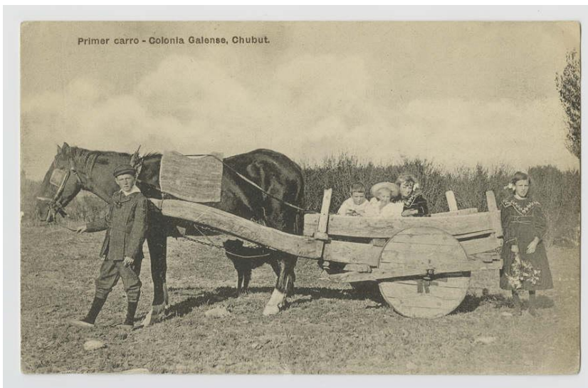
Postcard of the first cart in Patagonia, c.1866

Write a creative piece to describe what you see in the photograph.