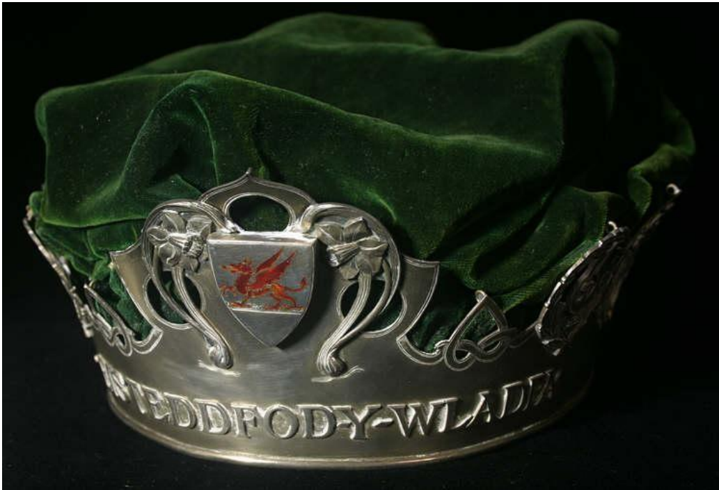
The crown of the Welsh Settlement's Eisteddfod

What symbols of Wales or Welshness do you see on this crown?