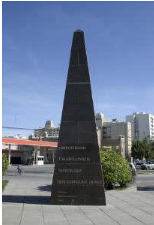
A memorial in Trelew to commemorate the centenary of the Welsh Settlement, 2005