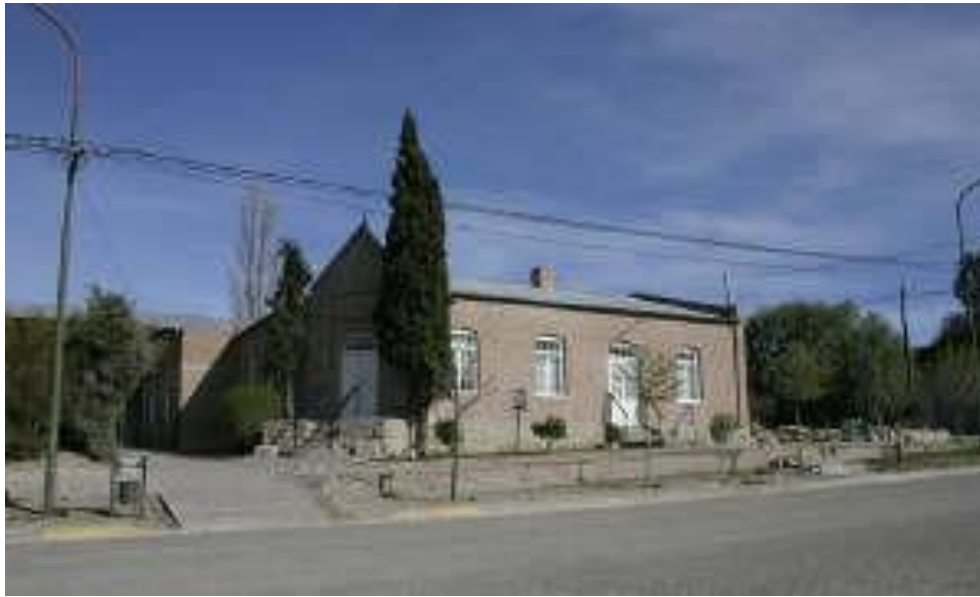
Gaiman secondary school - Coleg Camwy, 2005

Since its establishment in 1939, Cymdeithas Cymru-Ariannin (Wales-Argentina Society) has been an important link between Wales and Patagonia. It is a charitable organization which receives its income entirely from its members. The money is used to promote the Welsh connection by sponsoring exchange visits for teachers, students and ministers. Students from Patagonia are sponsored to attend Welsh courses at Lampeter every summer. Also, an annual competition is sponsored at the National Eisteddfod and education establishments in Patagonia.